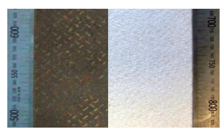
Detail view: L - Texline face; R - Texline backing.