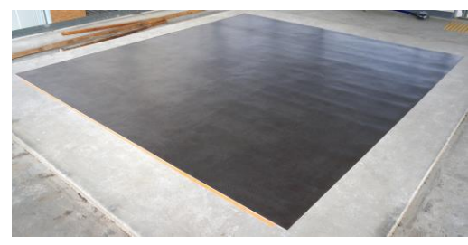
Test specimen installed in the laboratory for testing.