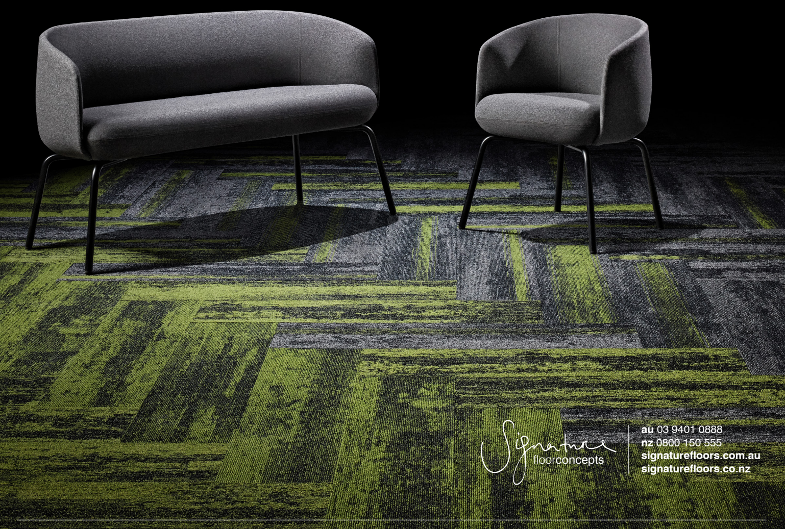
Terms & Conditions: Specifications are subject to manufacturing tolerances and may be changed without prior notice. Due lots may vary in colour from sample and between production lots. All product purchases are subject to Signature Floorcoverings Standard Terms & Conditions of Sale. Please refer to our Installation Guideline. Maintenance Manual and Warranty Document for further clarification. 01/20200