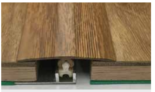
Expansion / Transition